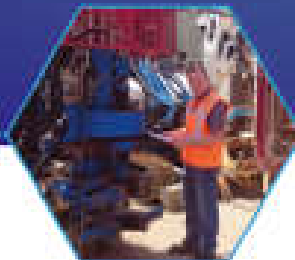
CLIPSTONE YARD FOCUS