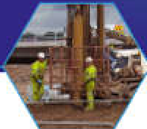
UK PROJECT UPDATE