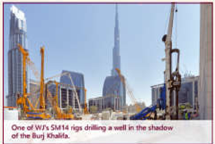
One of WJ's SM14 rigs drilling a well in the shadow of the Burj Khalifa.