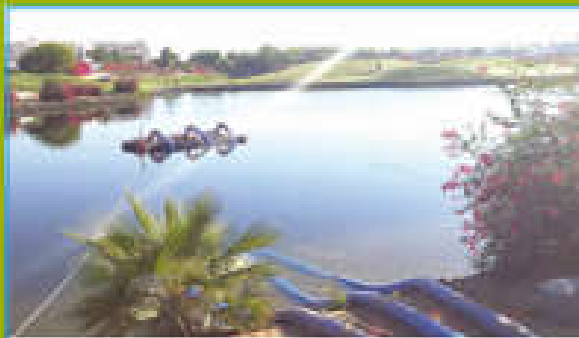
Montgomerie Golf Course in Dubai