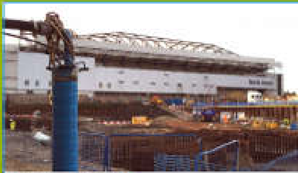
Tottenham Hotspur FC