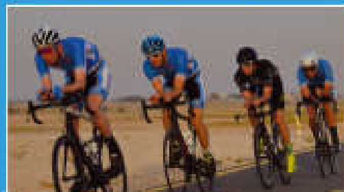
Emirates TTT Series June 2016