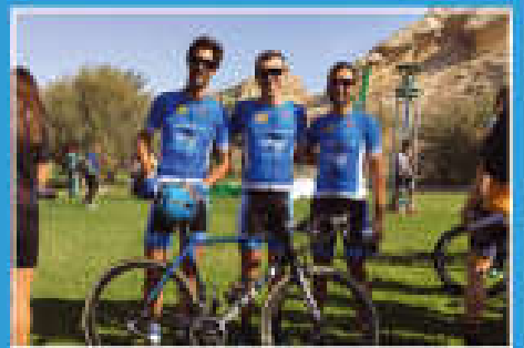
Hafeeet Race 1